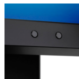
Ambient and human sensors